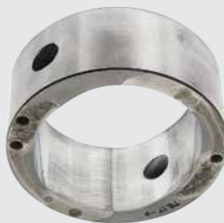
VANE PUMP CAM RING

Order by Phone 1-800-956-5695 - Give Operator Reference #5260701