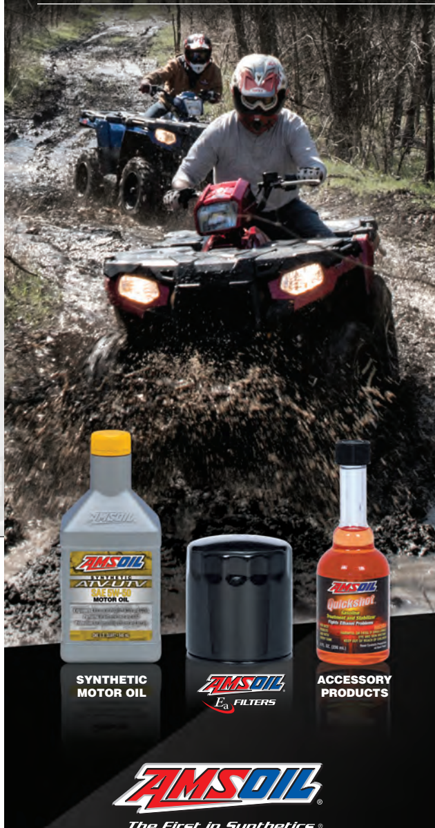
SYNTHETIC MOTOR OIL