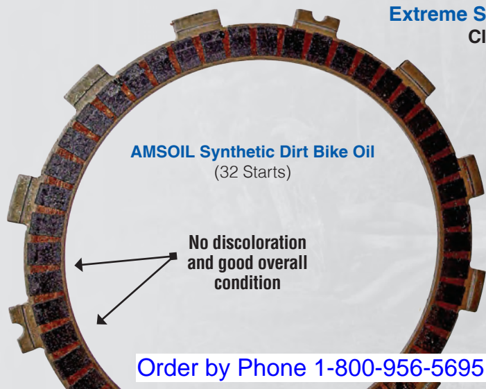
AMSOIL Synthetic Dirt Bike Oil (32 Starts)

No discoloration and good overall condition